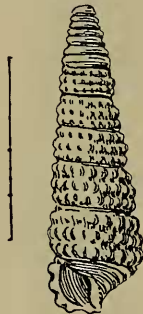
Triforis innocens , n.sp.

This shell is somewhat like C. albuginosa , Reeve, but of a more solid substance; its colour is plain brown without any indication of longitudinal streaks or other markings.